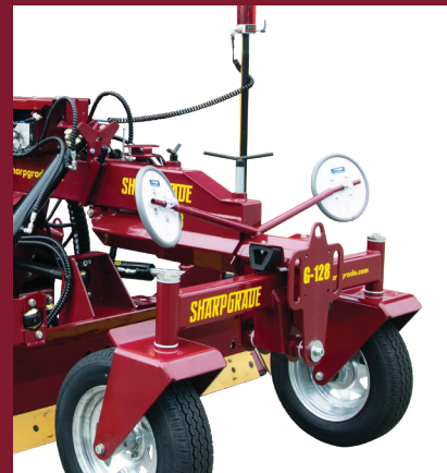
Telescopic retracting wheels for confined space / transport