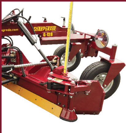
Rear blade to precision grade in reverse