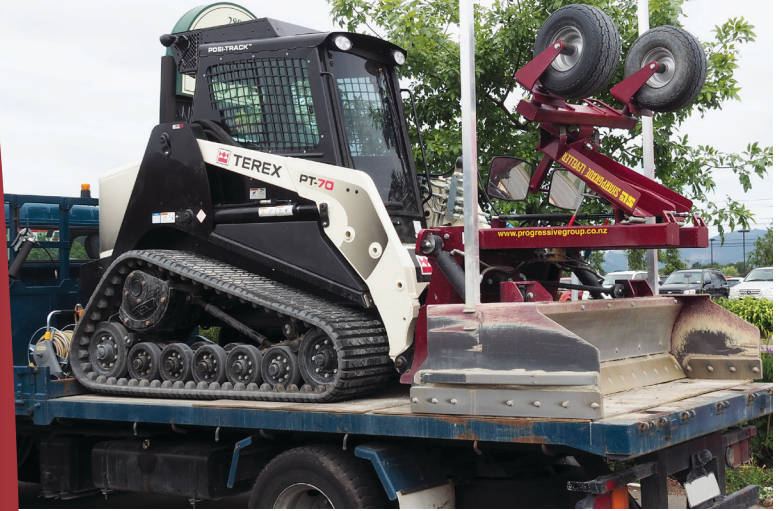
SHORT TRANSPORT LENGTH