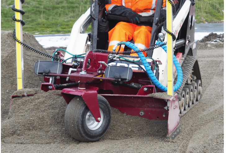
B60 JUNIOR 60" / 1.5M