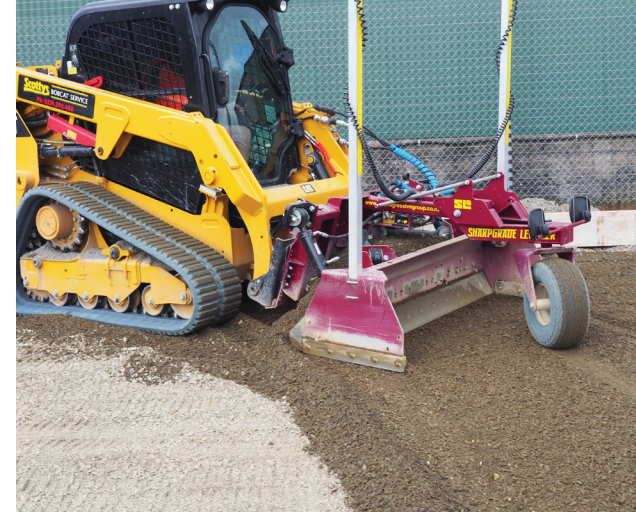
B72 COMPACT 72" / 1.8M