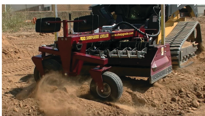
UNDERSLUNG WALKING BEAM