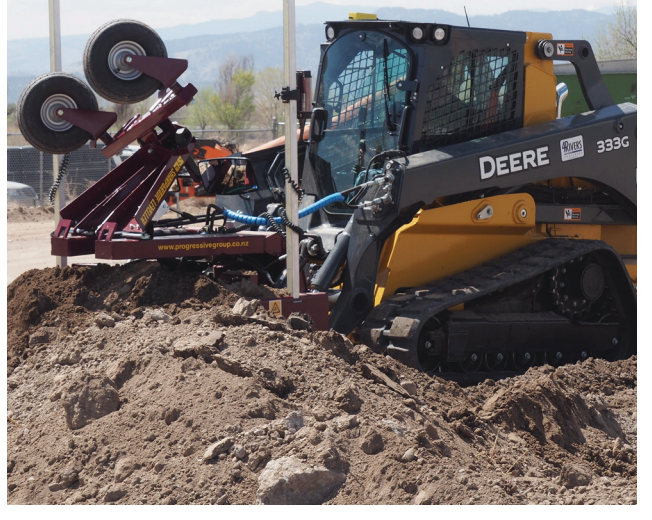
RETRACTING FRONT WHEELS