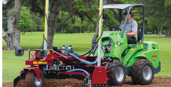
BF87 SHARPBLADE FIXED 87" / 2.2M