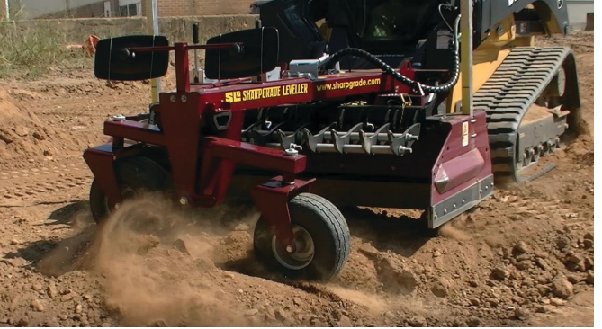
UNDERSLUNG WALKING BEAM