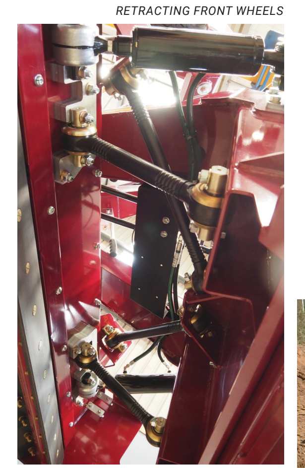
SEALED, GREASEFREE QUADROD ® LINKAGE