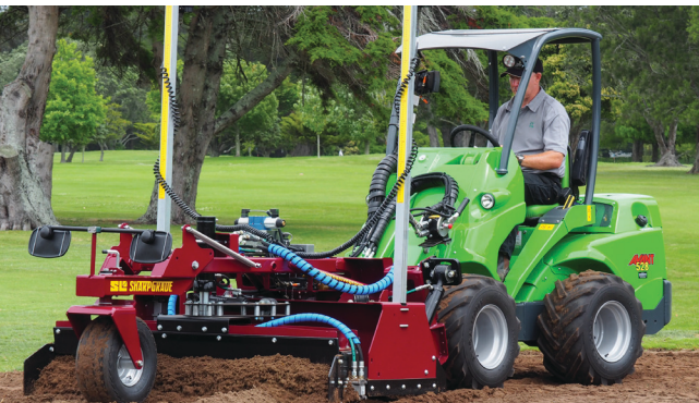
FRONT MOUNTED POWER RAKE OPTION